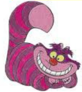
Homecoming October 9, 2010

The elementary teachers had good things to say about the letter posters and were so happy to know they were designed and completed by a Ferndale Area student. Thanks