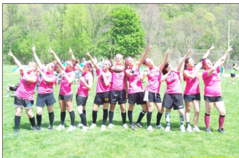
Picture taken from powder puff football game fundraiser.