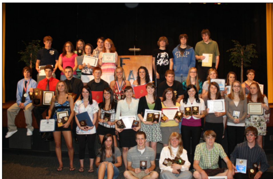
Students who received scholarships and awards.