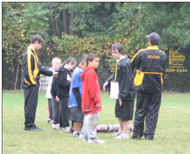
Picture taken from football camp fundraiser.