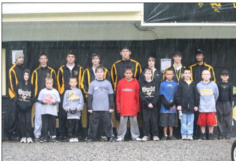
Picture taken from football camp fundraiser.